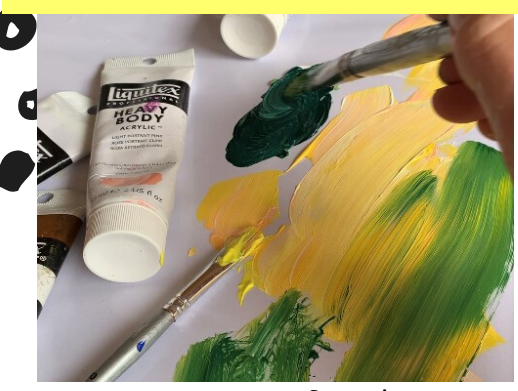
Now your transfer is ready for any painted elements you wish to incorporate.