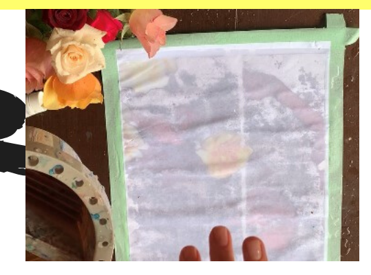
Once completely dry, turn the paper over and splash water on it. Allow to soak in for a few minutes.