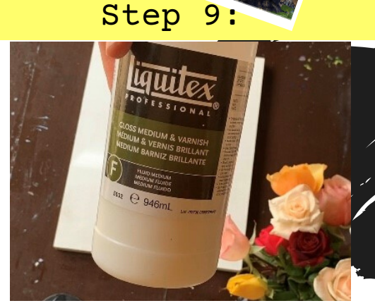
Take your chosen surface. In this artwork a board prepped with Gesso is being used. Place the Gloss Medium & Varnish on it.