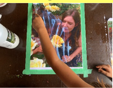
Apply a thin even layer of Gloss Medium & Varnish. Let it dry.