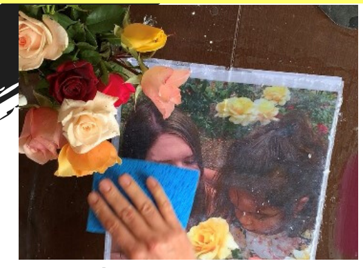
Use a damp sponge to remove any paper residue.