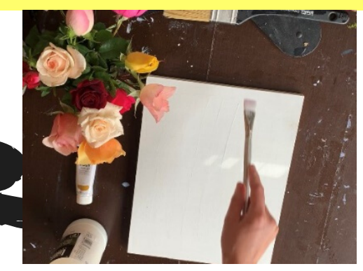
Apply a thin coat of Gloss Medium & Varnish to your chosen surface to bind the image to the film, acting as an adhesive.