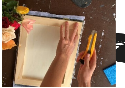
Turn your work over and use a knife to trim the sides.