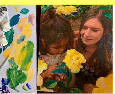
The result is an image that can be painted onto. It's a great way to add collaged elements to your paintings.