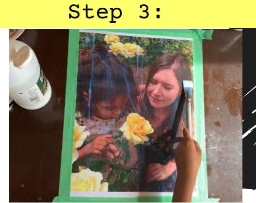
Repeat applications of the Medium until you have 4-5 layers on the image.