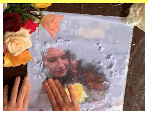
Gently rub the damp paper to remove the paper and reveal your image.