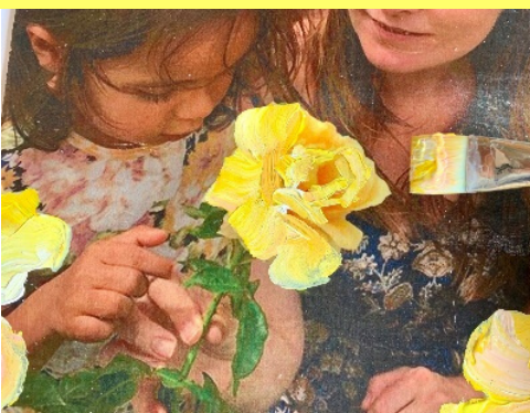
Add your choice of Liquitex paint and mediums for a painterly effect and to add texture to your acrylic transfer artwork.