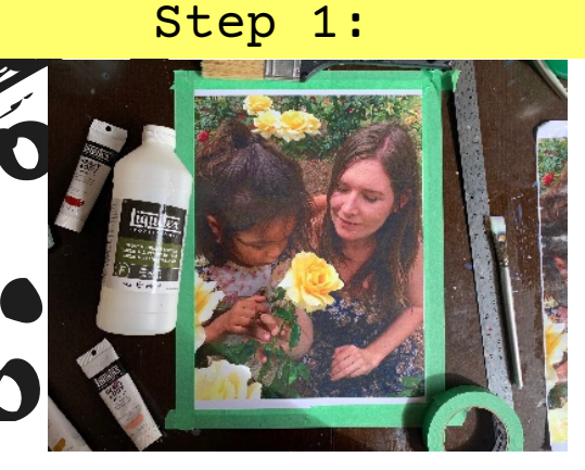
Print out the image you wish to transfer with.