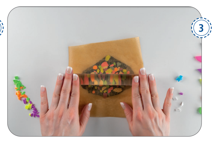
Now place a piece of baking paper over the FIMO sheet and confetti and roll over it with the acrylic roller, applying gentle pressure to bind the colourful confetti to the black FIMO. If you think the sheet needs a bit more colour, repeat steps 2 and 3.

Next place lots of confetti pieces in an uneven pattern on the black FIMO sheet. It looks especially good if the colours overlap.